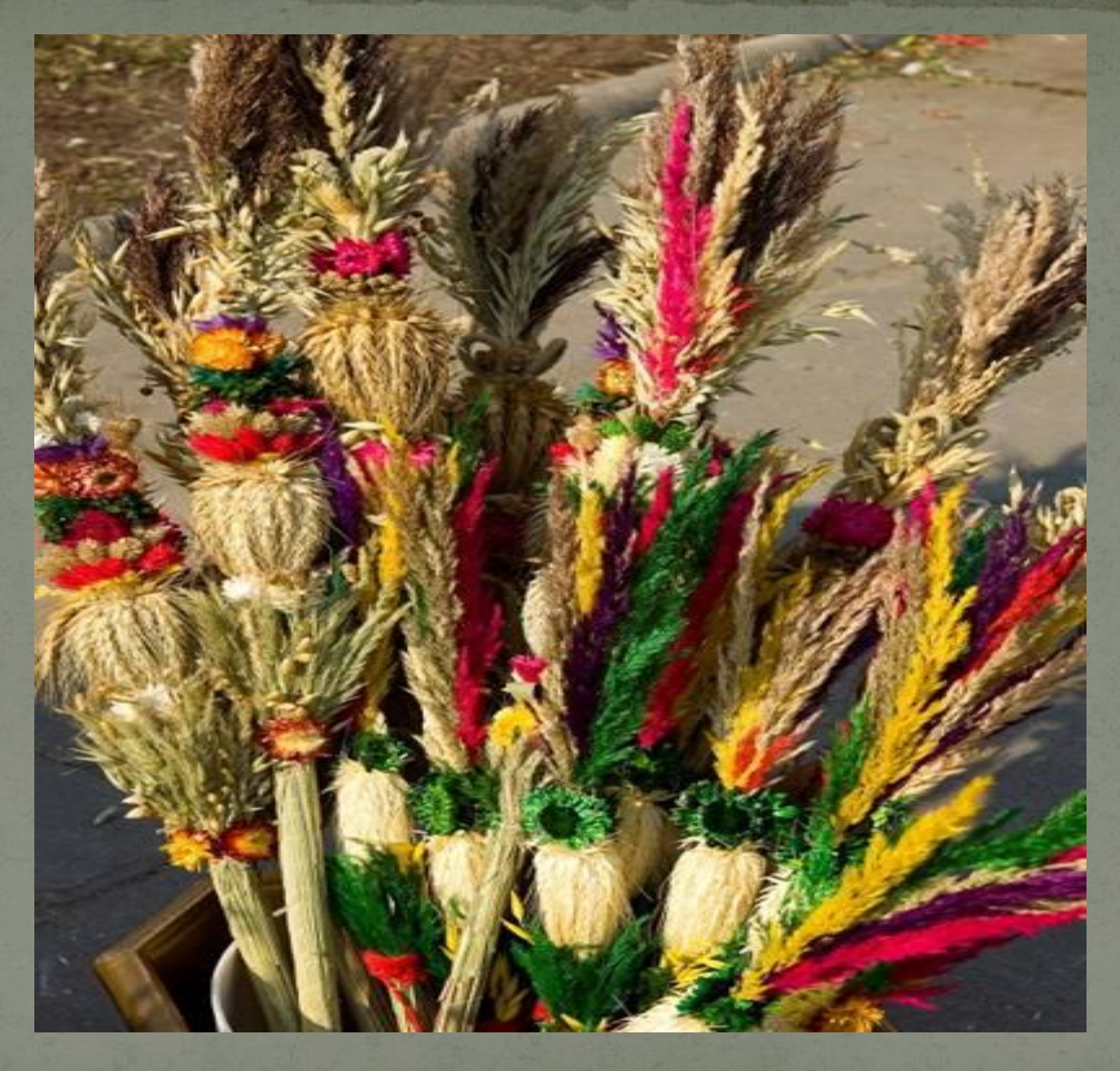
Look how colourful they are!