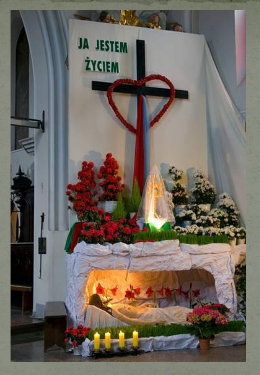
On Easter Day Jesus says, "I am alive!"