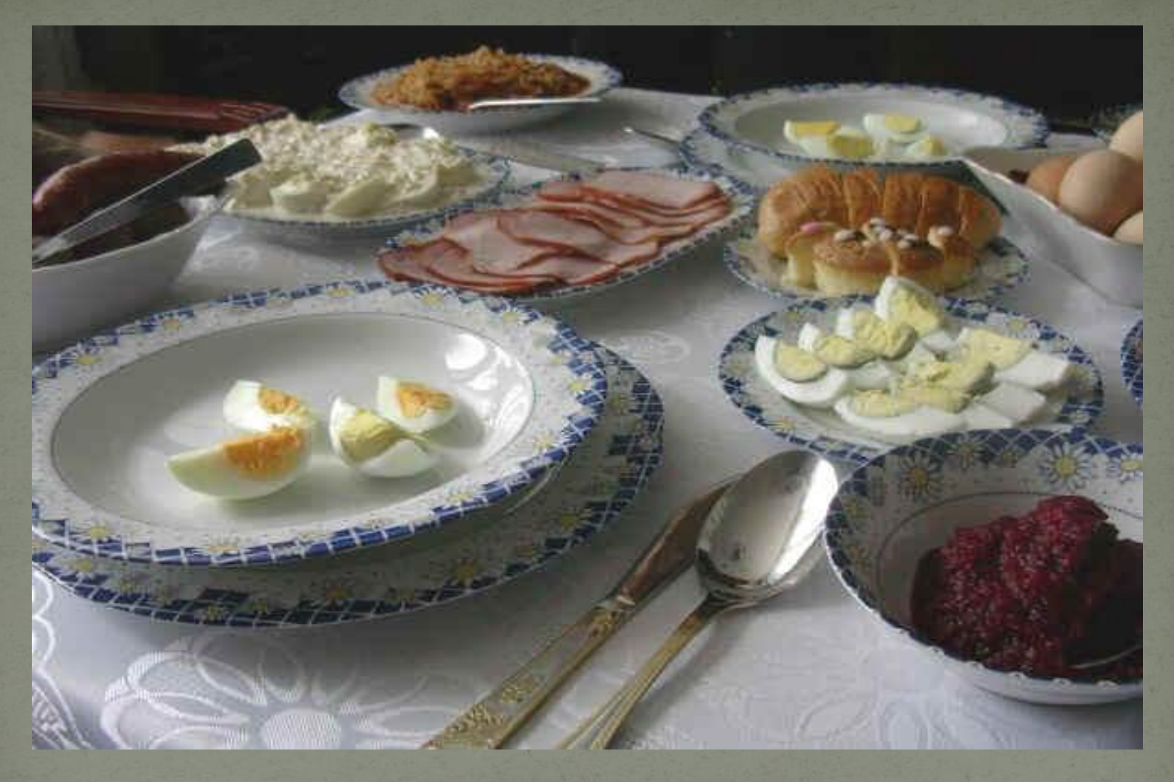
People eat eggs and ham on Easter Sunday.