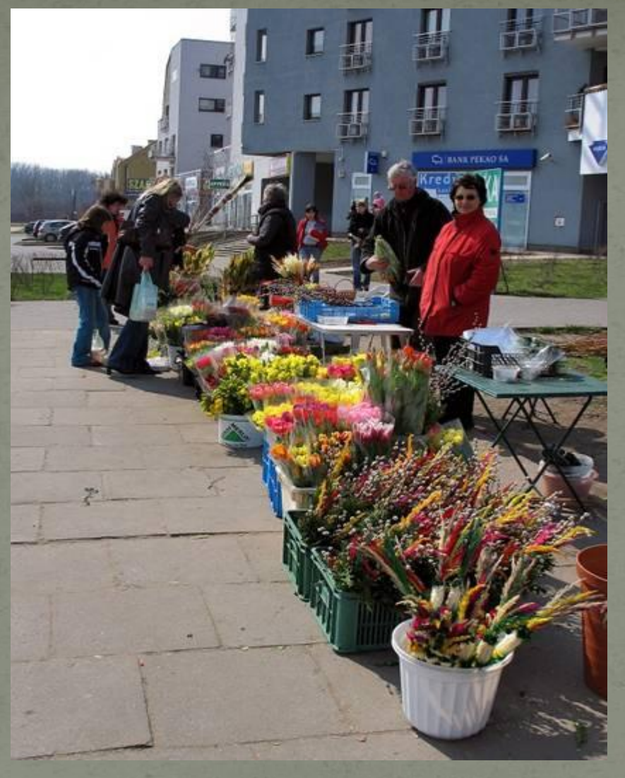
You can buy palms from the market.