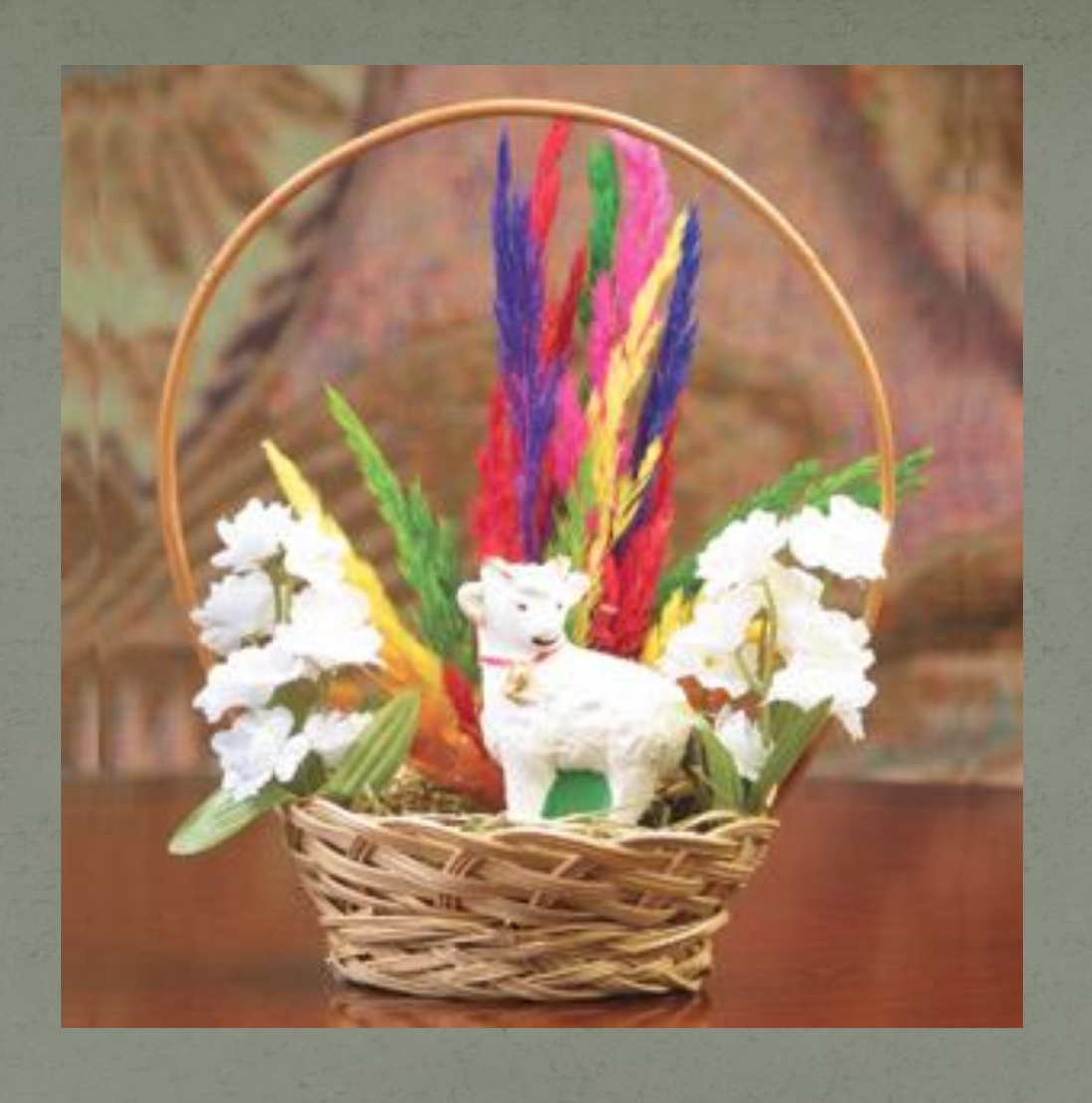
Can you see the palms again?