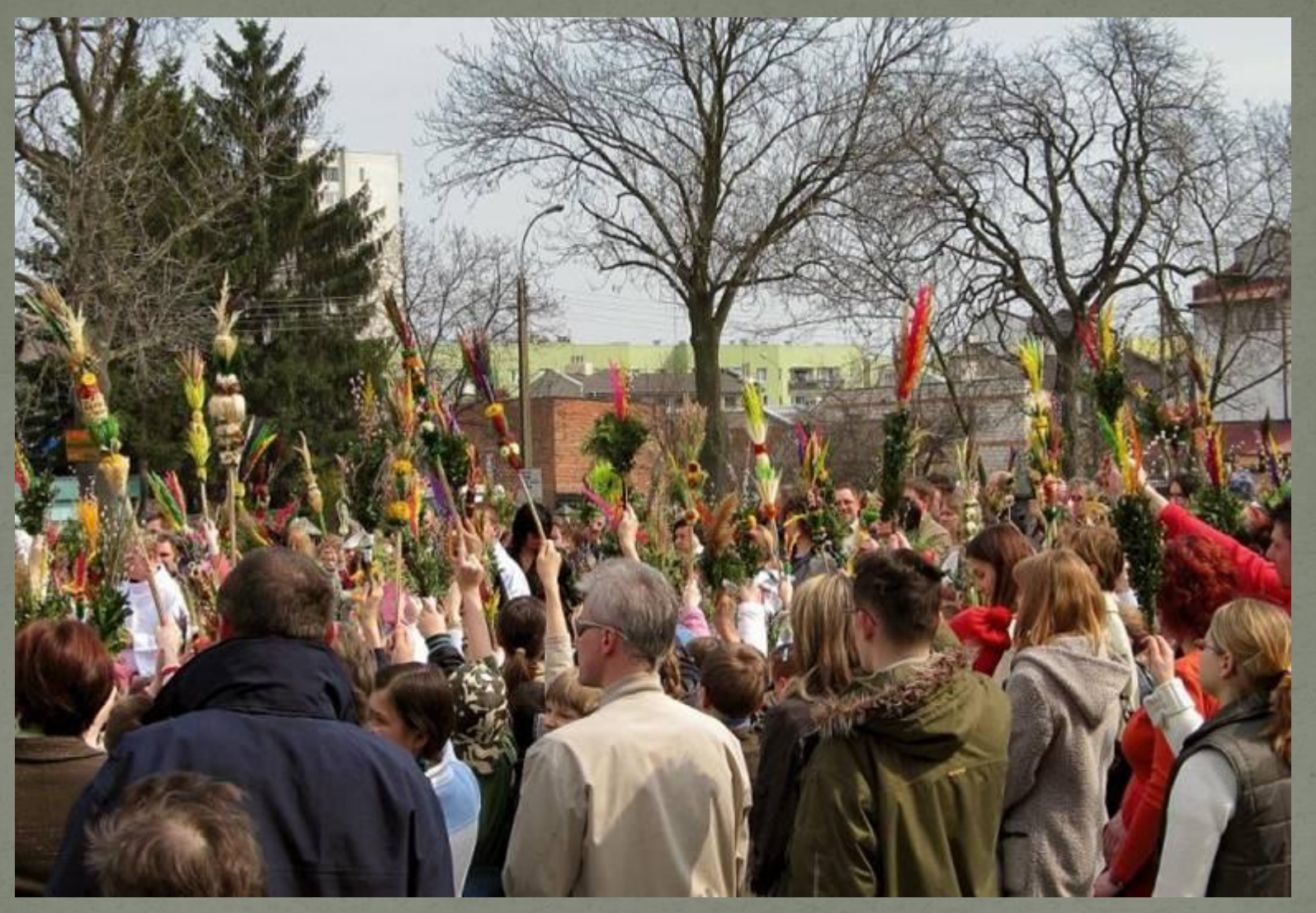
On Palm Sunday people take the palms to church.