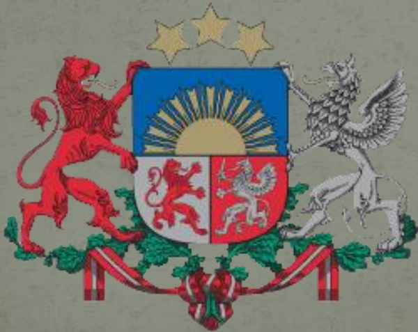
The Coat of Arms