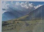
The Balkan Mountains in central Bulgaria

Bulgaria has a diverse climate, which results from its long peninsula and its location on the Balkan Peninsula. The climate is diverse, with a range of temperatures from -10°C to 40°C. The climate is diverse, with a range of temperatures from -10°C to 40°C. The climate is diverse, with a range of temperatures from -10°C to 40°C.