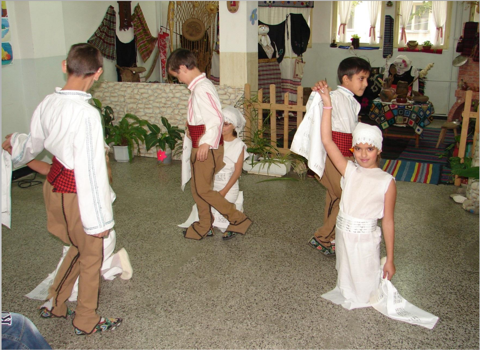
New generation maintaining their traditions