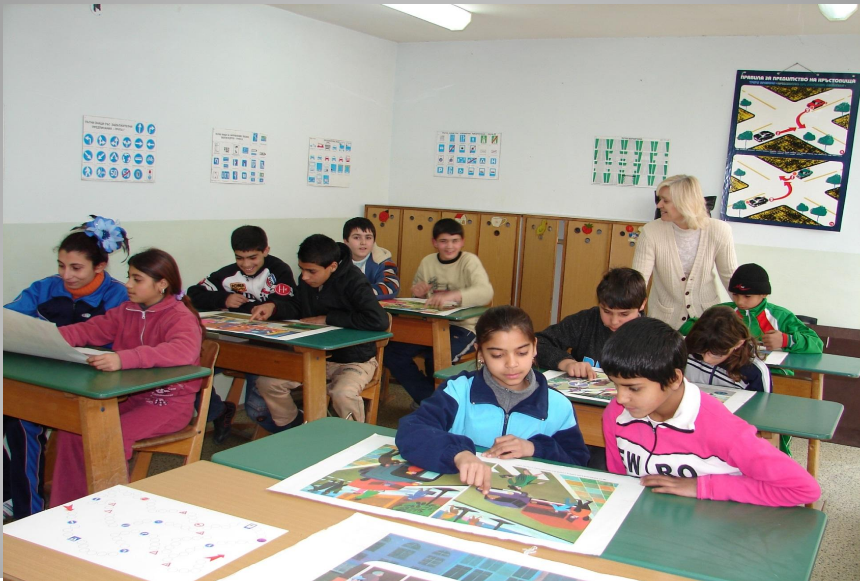
Road safety - basic knowledge