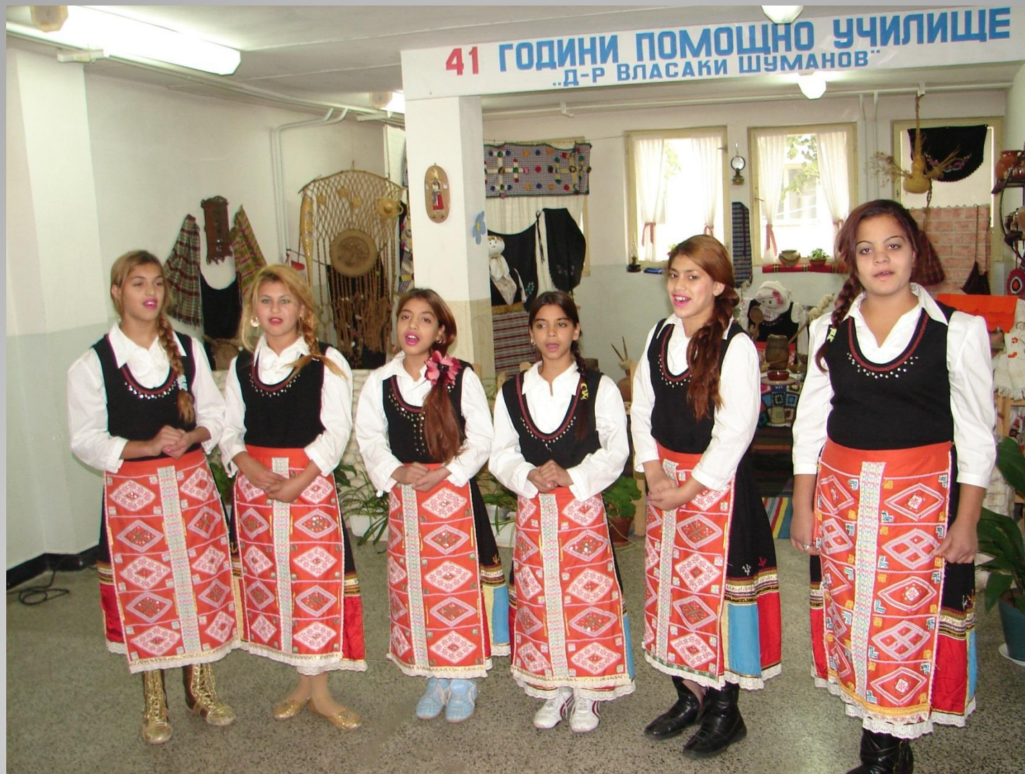
Children love their culture